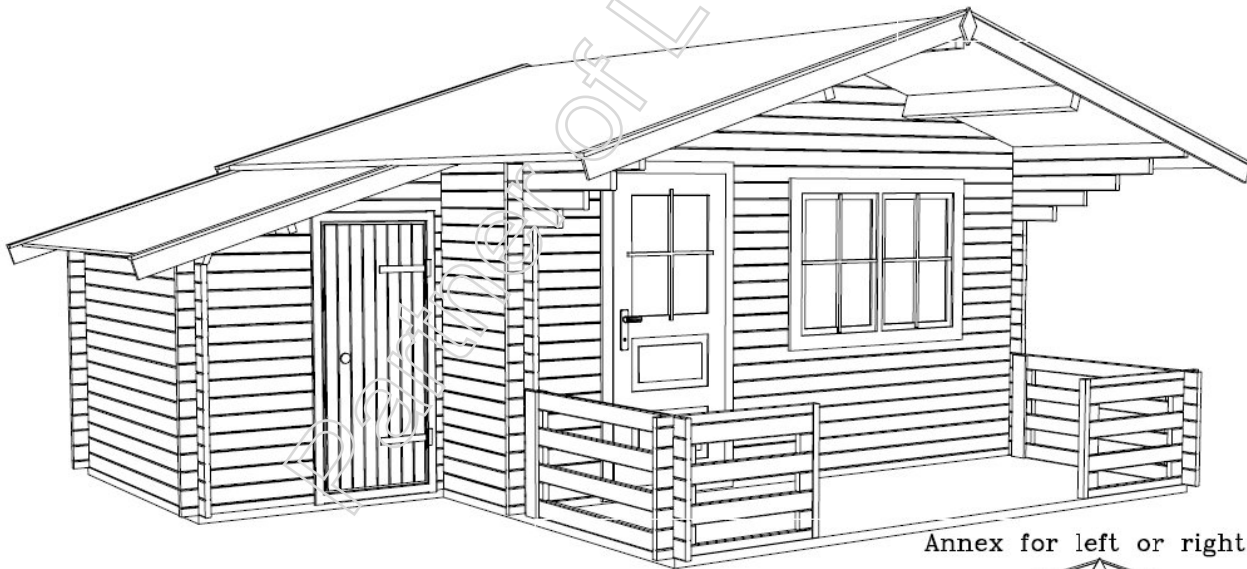
Annex for left or right side